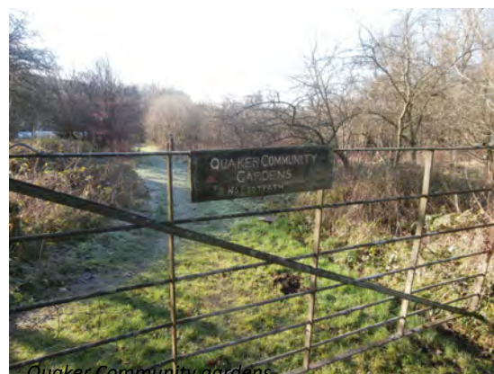
Quaker Community gardens

On our land, we have three main areas for growing vegetables, but we do not grow enough vegetables even for ourselves. What we do grow has no food miles. We make our own compost and avoid using pesticides. We have a variety of fruit including blackcurrants and apples, raspberries and wild blackberries. In a good year we have enough fruit in the freezer to supply desserts for our retreats and ourselves all year round. Each autumn we fell a large tree or coppice smaller ones to produce firewood for several wood burners. We have a wild flower meadow with a spiral walk, that we cut once a year using hand tools.