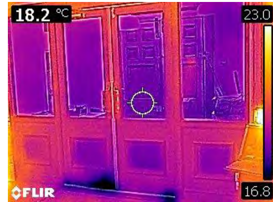
Thermal imaging before draught exclusion