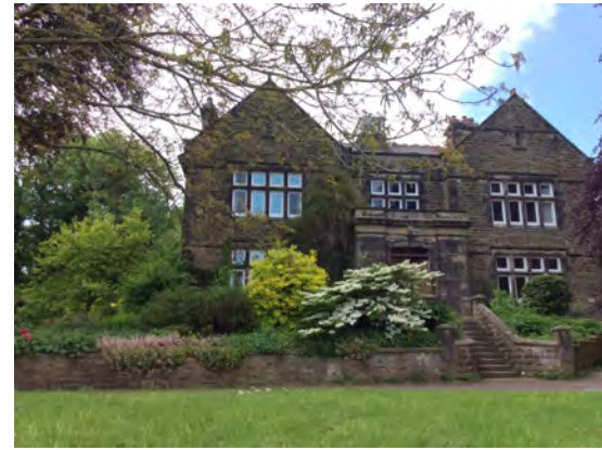
Quaker Community Front of House

Our experience with the humidity controlled heat recovery fan , has been far from positive, because the fan is noisy on its higher setting. In summer when the air outside is warmer and more humid than inside, it gets confused and stays on the higher setting all of the time, which disturbs people at night. So instead of a heat recovery fan we decided to put in cooker hoods in the kitchens. We were unable to find any cooker hoods with heat recovery. We also put in some CO 2 detectors.