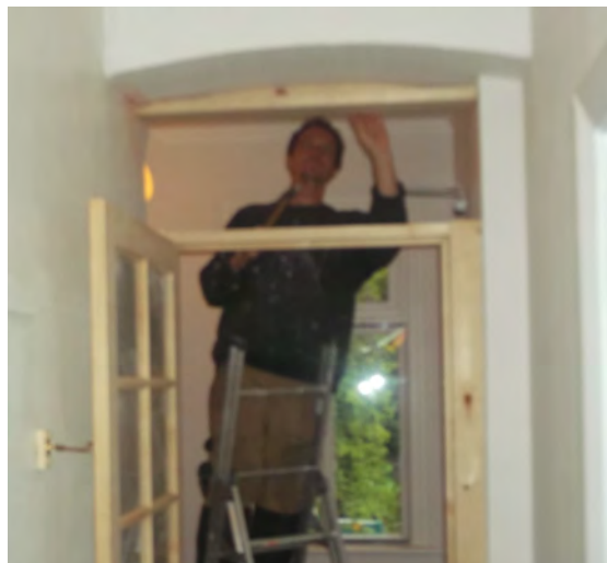
Draught exclusion - internal rear porch