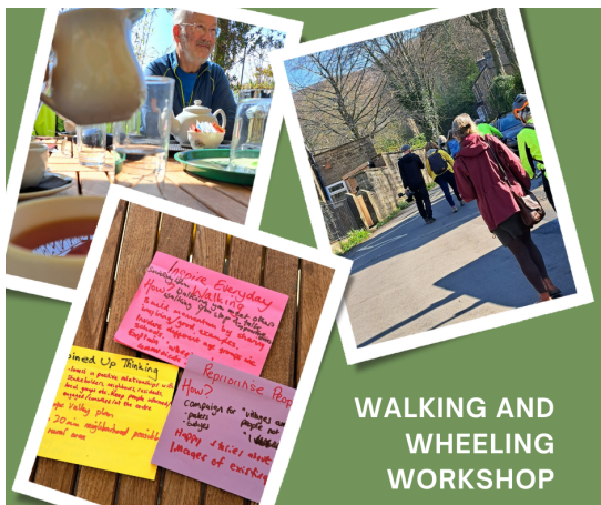
WALKING AND WHEELING WORKSHOP